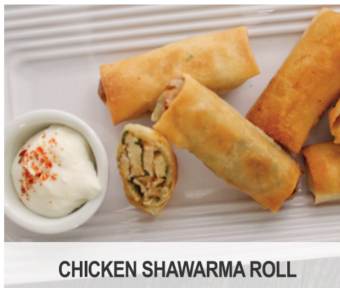
CHICKEN SHAWARMA ROLL