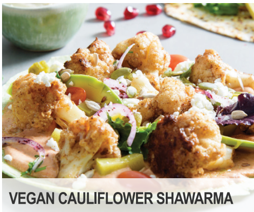
VEGAN CAULIFLOWER SHAWARMA