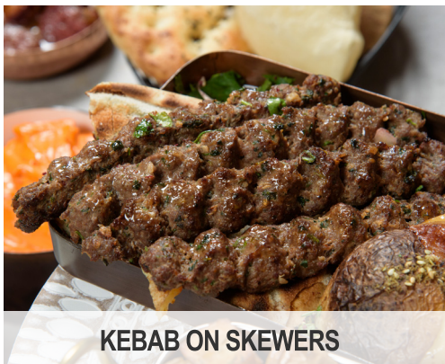
KEBAB ON SKEWERS