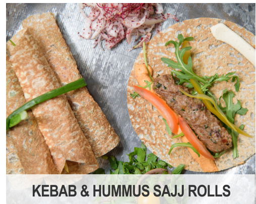
KEBAB & HUMMUS SAJJ ROLLS