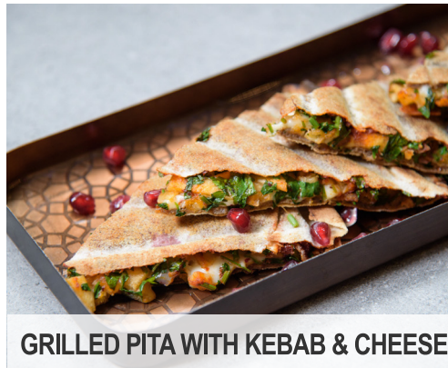
GRILLED PITA WITH KEBAB & CHEESE