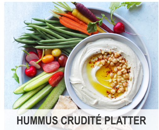
HUMMUS CRUDITÉ PLATTER